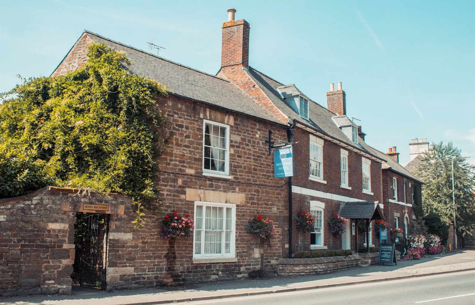
The Wisteria Hotel, 4 Catmose Street, Oakham, Rutland LE15 6HW